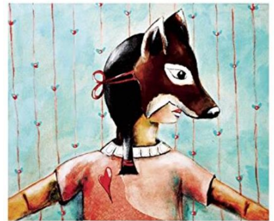
SOMETIMES I FEEL LIKE A FOX