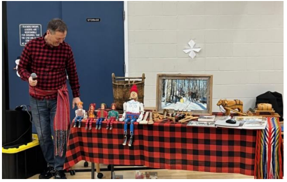
Thankyou to the parents who came out to help with the Maple Man!